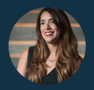
Director / Vancouver CEO, First Nations Technolgy