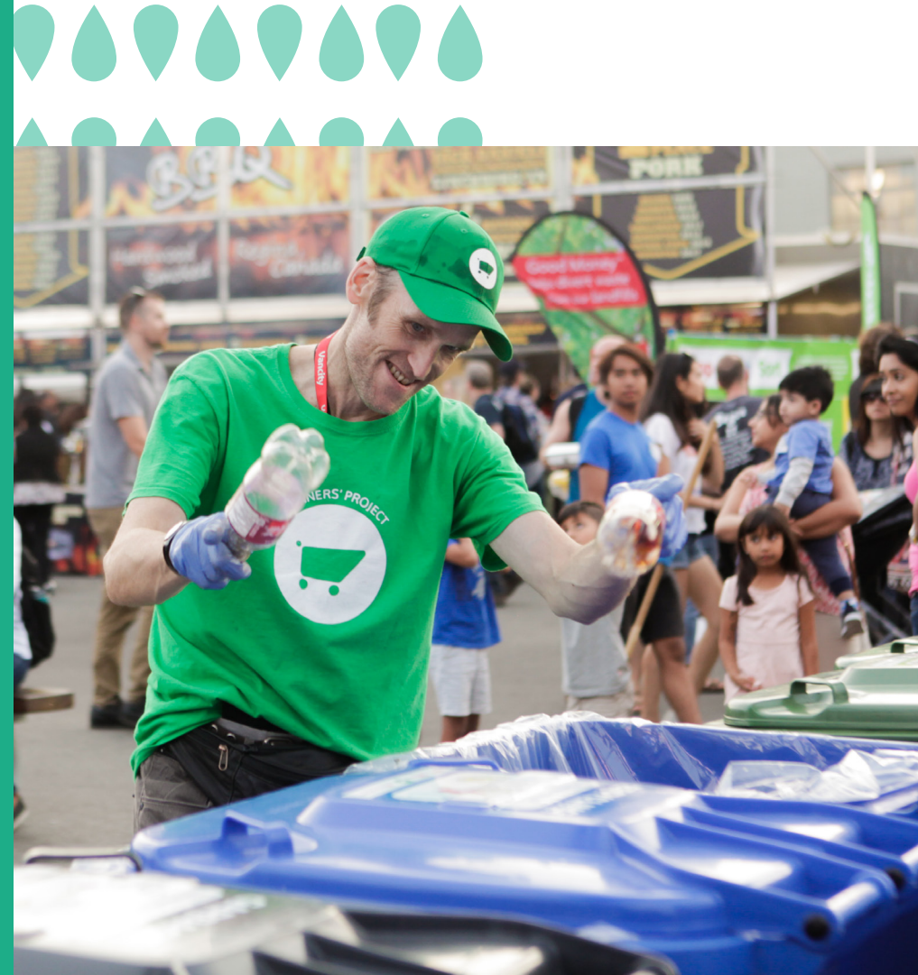
Binnars' Project is a group of waste-pickers aided by support staff dedicated to improving their economic opportunities and reducing the stigma they face as informal recyclable collectors.