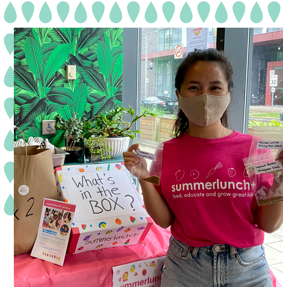
summerlunch+ provides healthy meals to students over the summer break. In 2020 they developed the summerlunch+ at home initiative which included a weekly food box and virtual program so that students could learn valuable food literacy and cooking skills at home.

With MakeWay's shared platform, changemakers share a suite of centralized organizational supports, and coaching when needed, so more time and money can go towards building strong, vibrant, just communities and a healthier planet.