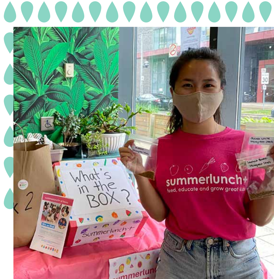
summerlunch+ provides healthy meals to students over the summer break. In 2020 they developed the summerlunch+ at home initiative which included a weekly food box and virtual program so that students could learn valuable food literacy and cooking skills at home.

With MakeWay's shared platform, changemakers share a suite of centralized organizational supports, and coaching when needed, so more time and money can go towards building strong, vibrant, just communities and a healthier planet.