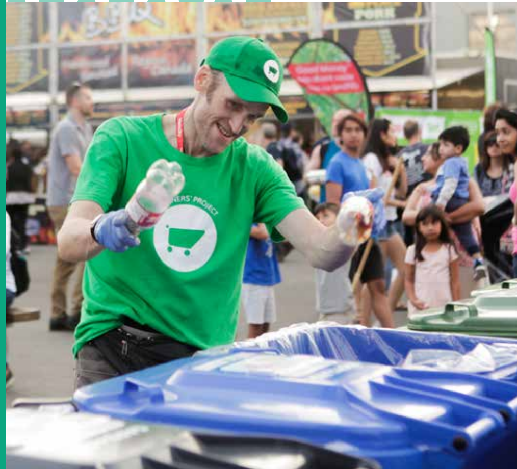
Binnars' Project is a group of waste-pickers aided by support staff dedicated to improving their economic opportunities and reducing the stigma they face as informal recyclable collectors.