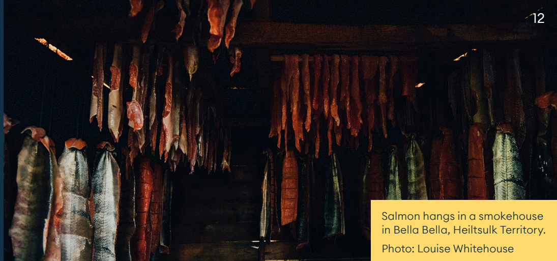
Salmon hangs in a smokehouse in Bella Bella, Heiltsuk Territory.

An equitable Charitable Sector Working for Planet and People