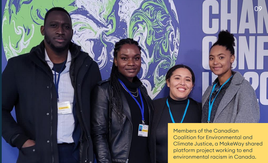
Members of the Canadian Coalition for Environmental and Climate Justice, a MakeWay shared platform project working to end environmental racism in Canada.

An equitable Charitable Sector Working for Planet and People