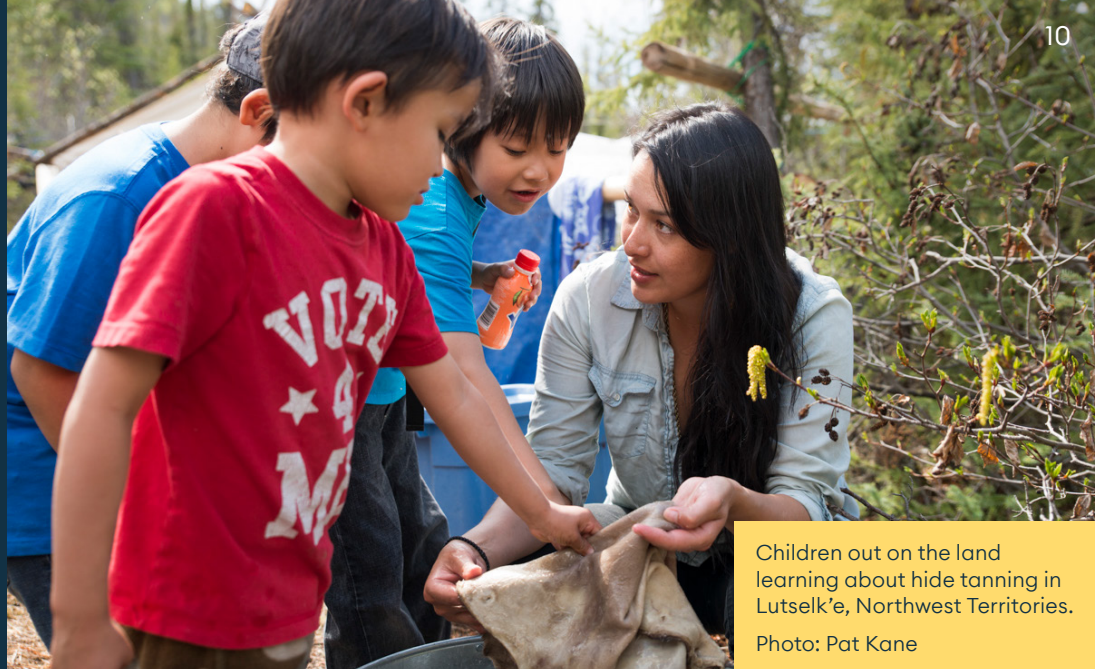
Children out on the land learning about hide tanning in Lutselk'e, Northwest Territories.

An equitable Charitable Sector Working for Planet and People