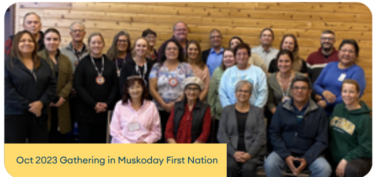
Oct 2023 Gathering in Muskoday First Nation