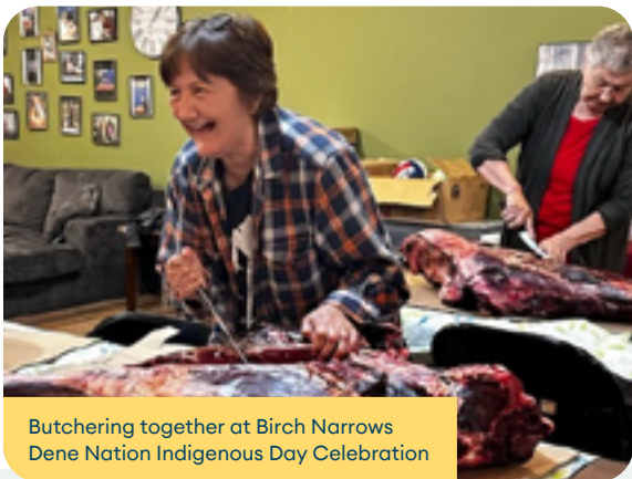
Butchering together at Birch Narrows Dene Nation Indigenous Day Celebration

The 'SK Program' utilizes a relational approach to identifying and making gifts. Gifting opportunities are shared at Working Group meetings, discussed, and consensus decisions made using the Giftmaking Guideposts, available resources, and local knowledge.