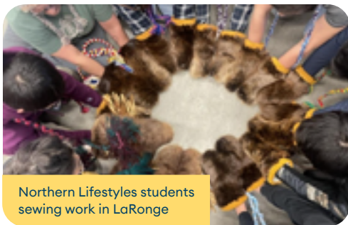
Northern Lifestyles students sewing work in LaRonge