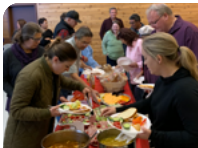
Oct 2023 Gathering feast in Muskoday