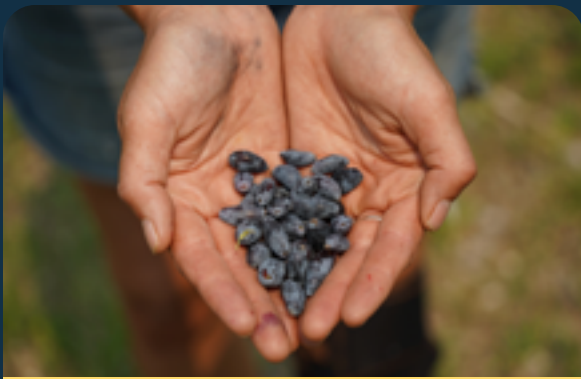
Haskaps