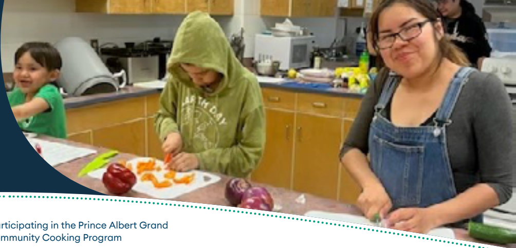
Families participating in the Prince Albert Grand Council Community Cooking Program

Together we bring more accessible philanthropic funding and supports to rural and remote Indigenous community-led work in Saskatchewan.