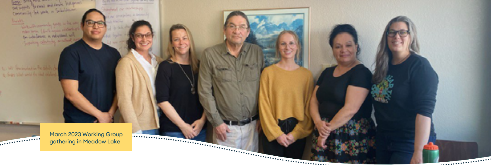
March 2023 Working Group gathering in Meadow Lake